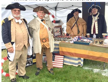
The Seattle Booth