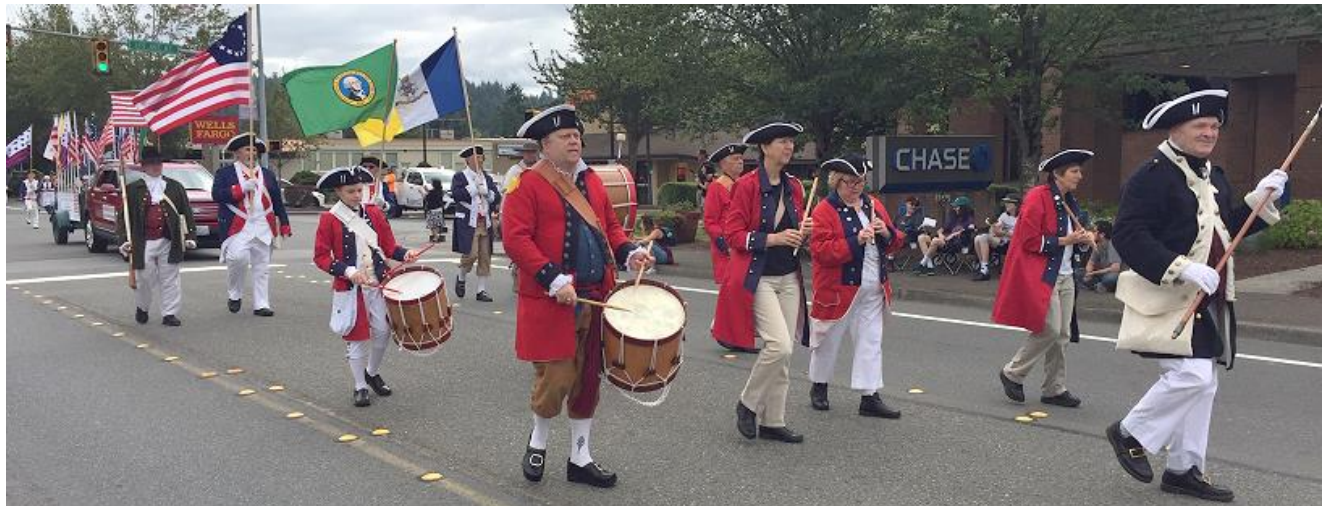
With the addition of the flag trailer, it was a large parade group.

22 Aug: The George Washington Chapter CG members at the Burlington Library.