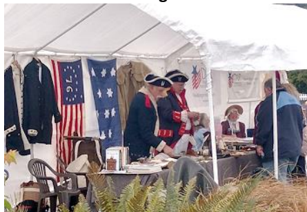
The JPJ Booth