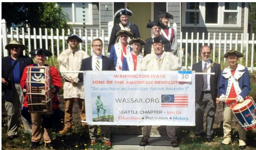
17 Aug: Celebrate Woodinville Parade. Again, we had a great turnout for this event. We had 26 members in the group.