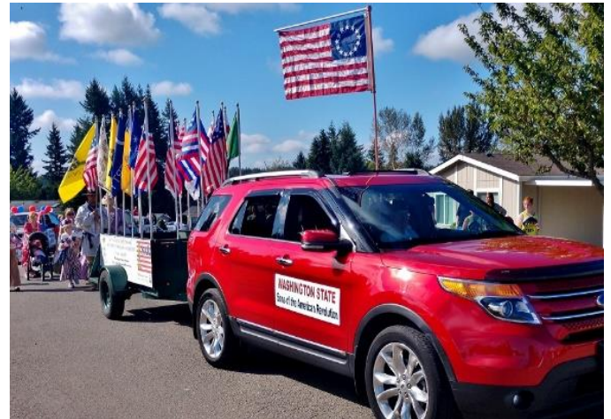
The flag trailer was well received.