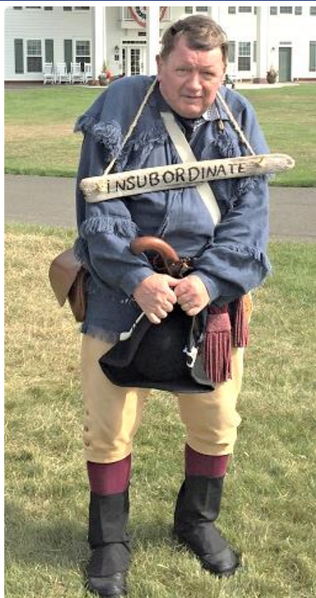
The Punishment for Insubordination (We all know who this is!)