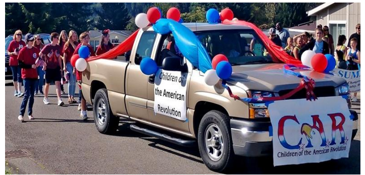
The CAR was out in force.