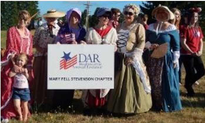
Here we see the DAR representatives.