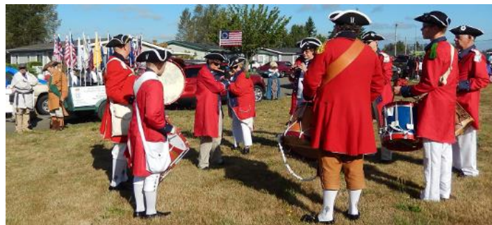
Here the F&D practice before the parade.

This might explain why the group took another 1 st place award.